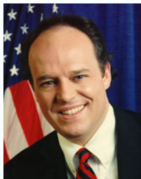
Peter G. Fitzgerald JD, President of Chain Bridge Bank in McLean, Virginia; former U.S. Senator from Illinois and State Senator in the Illinois General As- sembly.