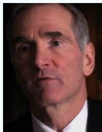
David F. Swensen Chief Investment Officer at Yale Uni- versity; inventor of the "Yale Model," an application of Modern Portfolio Theory; former Senior Vice Presi- dent of Lehman Brothers.