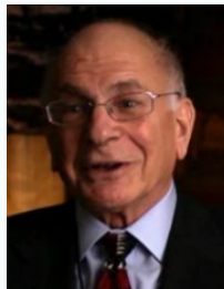
Daniel Kahneman Winner of the Nobel Prize in Economics, and Professor Emeritus of Psychology and Public Affairs at Princeton Univer- sity's Woodrow Wilson School.