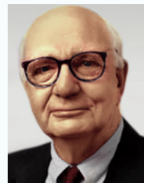
Paul A. Volcker Director and Counsel to a num- ber of corpora- tion and nonprofit organizations; former Chairman of the Federal Re- serve and the Eco- nomic Recovery Advisory Board.