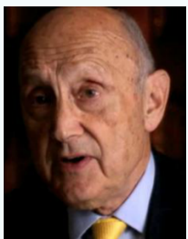
Burton G. Malkiel Professor of Eco- nomics at Princ- eton University; former member of the Council of Eco- nomic Advisors; President of the American Finance Association.