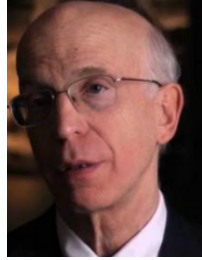
Alan S. Blinder Gordon S. Rentschler Professor of Eco- nomics and Public Affairs at Princet- on University. Co-di- rector and Founder of Princeton's Center for Economic Policy Studies.