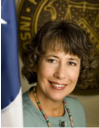
Sheila C. Bair Senior Advisor to The Pew Charitable Trusts; former Chairman of the Federal Deposit Insurance Corpo- ration.