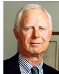
Arthur Levitt Senior Advisor at the Carlyle Group; former Chairman of the U.S. Securi- ties and Exchange Commission and Chairman of the American Stock Exchange.