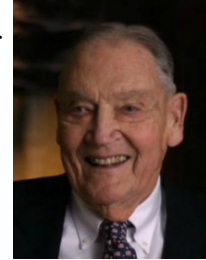
John C. Bogle Founder and for- mer CEO of The Vanguard Group and President of Vanguard's Bogle Financial Markets Research Center.